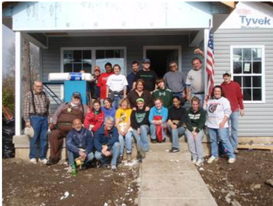
1 Holmes House built by TriState Habitat

Prepared by the Federation of American Scientists