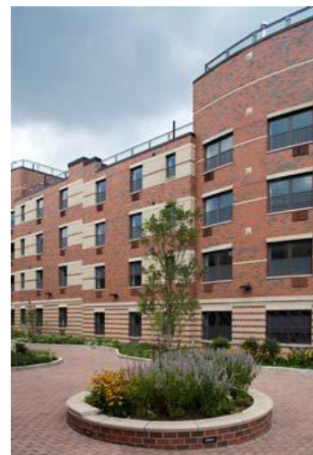
18 Atlantic Avenue Residences--LEED Gold certified project

Habitat for Humanity of Washington DC builds approximately 10 houses per year on their 53-lot development in the Deanwood neighborhood of Northeast Washington, DC. Over the past year their houses have been achieving a HERS score of 74-75 and have been ENERGY STAR certified. The houses are located in close proximity to public transportation (both a metro station and bus lines) and feature numerous recycled and high performing materials, including recycled gravel and rain gardens with recycled concrete pavers, permeable pavers on the driveways, ICFs in the basement, and Hardiplank siding.