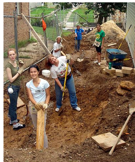
13 Rain Garden built by DC Habitat

While the WaterSense specifications for interior water use should be followed, their landscaping water consumption limitations need to be tighter for Habitat affiliates in order to meet the Habitat goal of reducing operations cost and maintenance for families. Instead we recommend eliminating turfgrass altogether and replacing with a drought tolerant ground cover in all areas of the country except where turf grass can survive without additional watering or fertilization. Consider xeriscaping the yard, a system of landscaping and gardening that reduces or eliminates the need for supplemental irrigation. In some areas, terms such as water-conserving landscapes, drought-tolerant landscaping, zeroscaping, and smart scaping are used instead of xeriscaping. Typical plants used for xeriscaping are native to the area, and require little-to-no supplemental fertilizer. In addition, to prevent water runoff from the property, non-permeable paved areas should account for no more than 10% of landscaping area. If your affiliate is located in an area with moderate or greater rainfall, to further reduce runoff you may want to install a rain garden—talk to local nurseries or hardware stores about donating plants that are mature enough to need only minimal watering after the first year.