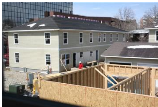
17 Bails Townhome Community—Green Communities certified

Denver Metro Habitat builds 30-40 houses per year in the Denver, Colorado metropolitan area. Their HERS average score for houses built in the past year is a 57 and they are active in multiple green building programs. Green building certificates Denver Metro has received include: Five Star Plus ENERGY STAR, Builders Challenge, and LEED, and they are currently building a 24 unit Green Communities certified project.