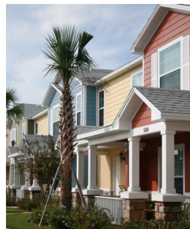
20 Stag Horn community

Habitat for Humanity of Orlando in Orlando, Florida has been building single-family homes since 1986. In 2009 they built 17 town homes, all of which were ENERGY STAR certified. Four years ago Habitat Orlando began developing their first multi-family community, Stag Horn Villas, which is Florida Green Building Coalition (FGBC) Gold certified in addition to ENERGY STAR certified. The average townhome in this community, in 2009, received a HERS score of 72 and includes numerous high performing features, including: white roof shingles; a shade porch; low-VOC interior paint; recyclable carpeting; and security features such as a burglar alarm system, monitored fire sprinklers, and site illumination.