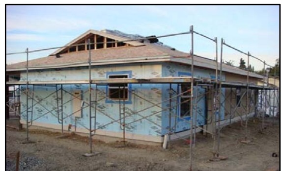
3. ONE INCH EXPANDED POLYSTYRENE FOAM APPLIED TO OSB SHEATHING TO PROVIDE CONTINUOUS THERMAL BREAK AND ADDITIONAL R-5 WALL INSULATION

TPCHFH is committed to building their homes to the highest green building standards feasible to ensure Habitat's families benefit from healthier indoor living conditions, lower utilities bills, and thriving natural environments.