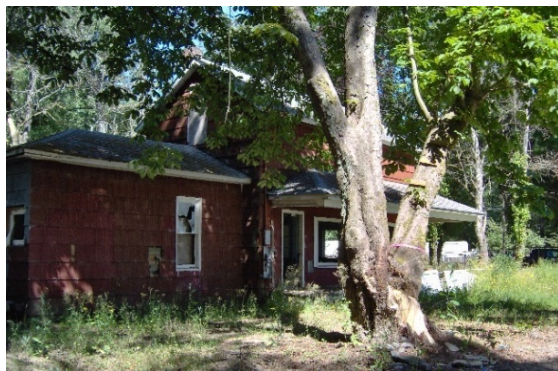
7. ABANDONED RESIDENCE WITH MATURE CHESTNUT TREE

soils has been found so far. However, some amended soils may need to be brought on-site to enhance the landscaping and provide for safe gardening opportunities.