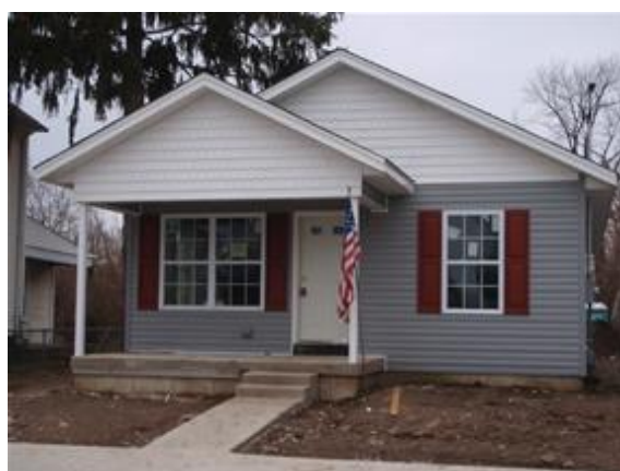
24 Holmes House, HERS Index score of 50

TriState Habitat builds single family houses in Ohio, Kentucky, and Indiana. TriState's lowest HERS score to date is a 50 on a house that achieved ENERGY STAR, LEED, and NAHB Gold certification. One project currently under construction (as of October 2010) will be built to the ENERGY STAR 2012 standards. TriState partners with ENERGY STAR and with NAHB for both the National Green Building Program and Certified Aging in Place program. Their houses save families on average $409 per year in operating costs. High performing features and technologies in their projects include Blown in Blanket System® in the exterior walls (achieving a wall value of R-30+, blown insulation of R-50 in the attics, a 92% efficient furnace, a Rinnai tankless water heater, extremely airtight construction practices, and drought tolerant landscaping.