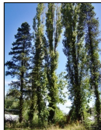
6. TREES ON SITE

There are 467 trees on the main parcel. Seven trees were deemed 'significant' and will be protected during the development. For more information about tree conservation regulations review the Pierce County Code Tree Conservation Ordinance (Chapter 18H.40), at: http://www.co.pierce.wa.us/xml/Abtus/ourorg/council/code/title%2018h%20pcc.pdf#Page=19