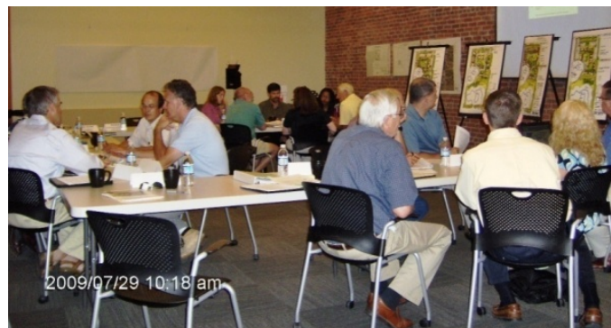
1. ECO-CHARRETTE DISCUSSION

The results of the brainstorming exercises and discussions are outlined in this report and will provide guidelines for meeting and exceeding requirements of the Evergreen Sustainable Development Standard (Evergreen Standard) and the LEED for Homes® rating system. Meeting the Evergreen Standard is required in order to receive funding from the Washington State Housing Trust Fund.