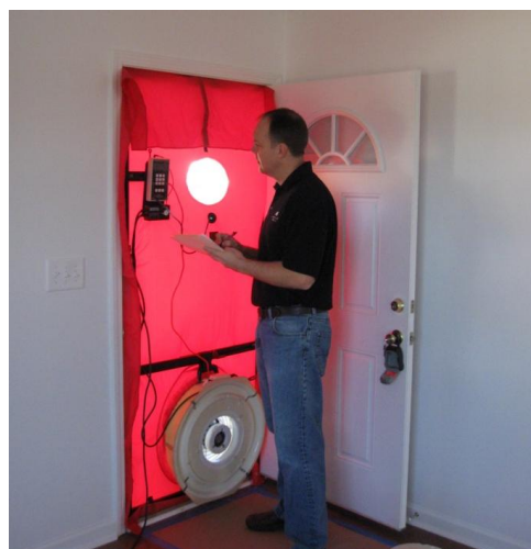
15 Volunteer blower door test