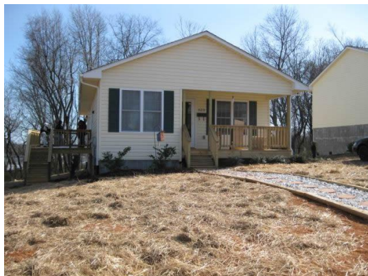
16 Earthcraft Virginia certified house

Danville Habitat builds several houses each year and completed four in 2009. All of their houses are Earthcraft Virginia and ENERGY STAR certified, with their Earthcraft projects receiving HERS scores in the mid-50s. They have completed five Earthcraft homes that have saved families 40%-50% on their utility bills. Data is provided through a partnership with the local utility company. High performing features of Danville Habitat's projects include a tankless hot water heater, extensive air sealing that gives their houses an air infiltration rate of less than 10%, and a waste stream reduction of 30% overall and 90% for cardboard.