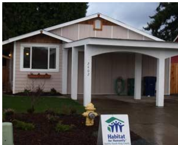
22 Westway home rehabilitation project

Seattle/South King County Habitat builds 16-20 houses per year in Seattle and the surrounding metropolitan area. In addition to new, single family homes, Seattle Habitat builds multifamily units in the City of Seattle and has rehabilitated some existing homes. Recent houses have met the Evergreen Sustainable Development Standard (ESDS) and are ENERGY STAR certified, receiving a HERS score of almost 100 due to their use of electric resistance heating and heat recovery ventilators. Seattle Habitat's recent projects have featured a charette design process, partnership in design with Building America staff and LEED providers, and WaterSense certified appliances and fixtures.