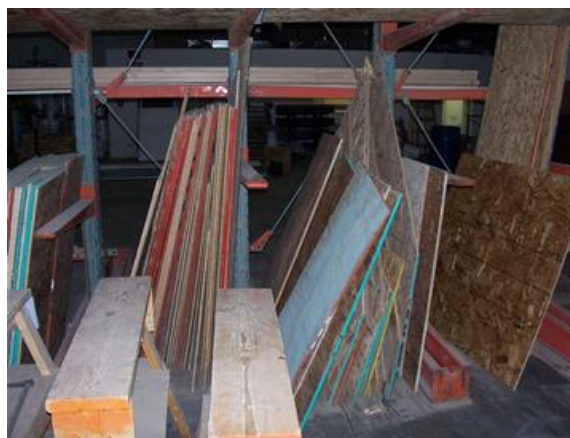
8 Metro Denver warehouse for building components and storing scrap materials