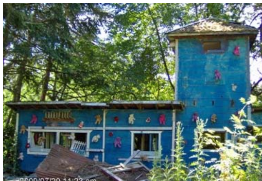
8. ABANDONED SHED DECORATED WITH TEDDY BEARS

The two structures currently on-site (pictured above) are scheduled for demolition. TPCHFH will work with the local comingled construction and demolition recycling companies to salvage and recycle as much as possible.