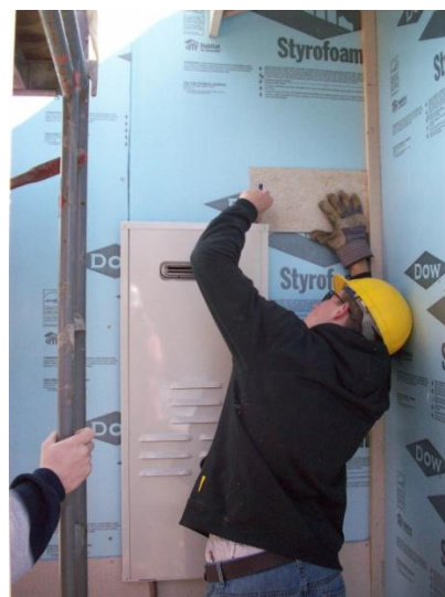
9 Larabee Terrace donated blueboard-- Tacoma Habitat

Integrate donated or discounted materials wherever possible, especially critical multipurpose materials such as insulation and sealants and also expensive, but essential equipment such as HVAC systems and hot water heaters. For more information on acquiring donated or subsidized materials from national partners, see MyHabitat.org. For details on contacting local manufacturers and suppliers to inquire about available donations and discounts, see Section 2 "Partnerships".