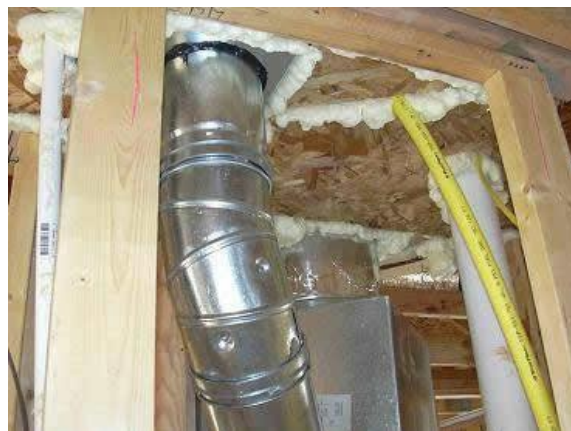
7 Sealed ducts in conditioned space--TriState

Design the size of the ducts and the HVAC load sizing together, using ACCA Manual J and D calculations for duct sizing. If possible, ducts should be located within the conditioned space rather than in an uninsulated attic and, if not, ducts must be insulated along their length to at least R-6 in hot and mixed climates and R-8 in cold climates. Ducts should also be air sealed at seams and joints with mastic. Proper duct sealing should be verified through a duct blaster test, details for which can be found in Section 16 "Verification".