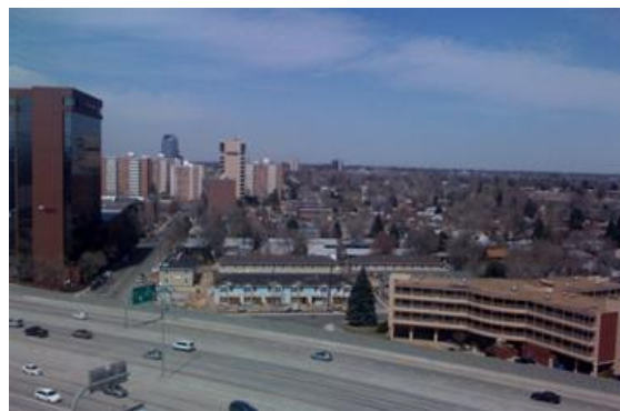
10 The Bails Townhomes Community is located less than 0.5 miles from a Denver Light Rail station

Convenient access to public transportation, necessary services, and employment is a critical component of a high performance location. Adequate access, as defined below, improves the livability and functionality of the house and also reduces the carbon footprint of the residents as they are able to commute, go to school, and obtain necessary goods and services by walking or taking public transportation.