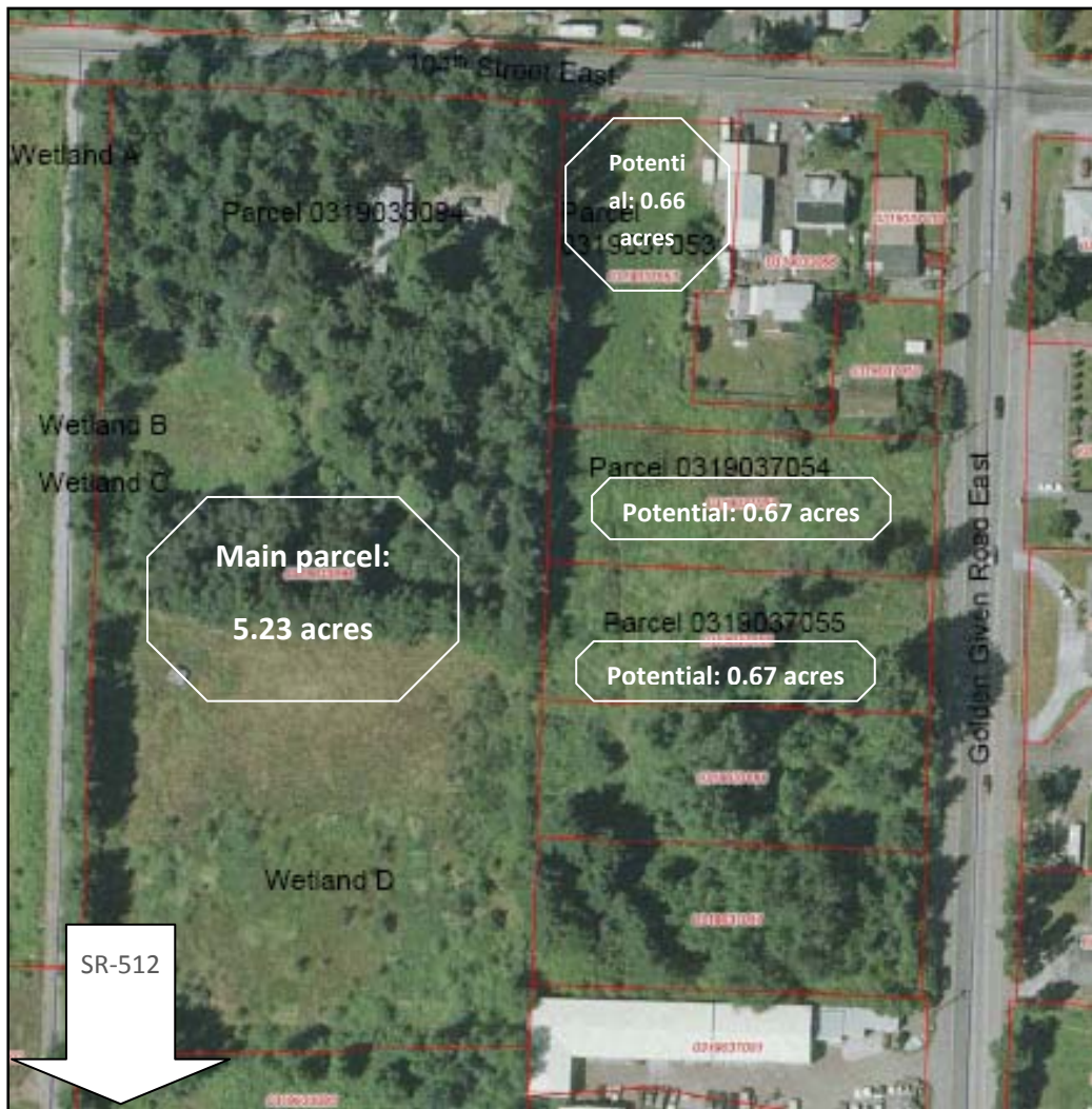
5. AERIAL SITE PHOTO