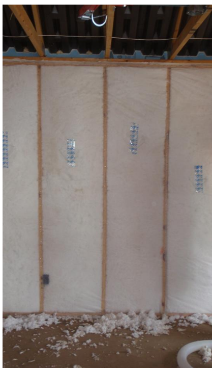
2 Donated Blown in Blanket System®-- TriState Habitat

Otero Habitat partnered with the PNM Resources Foundation, the granting arm of their electric utility and the New Mexico Solar Energy Association to conduct a course for Habitat volunteers and community members on how to install solar PV. After a weekend of classroom instruction by the Solar Energy Agency, participants installed solar panels on the roof of Otero's latest Habitat house. The Habitat volunteers who attended the class will form the Habitat PV installation team for subsequent builds. Solar panels for the Habitat House were also provided by a PNM grant.