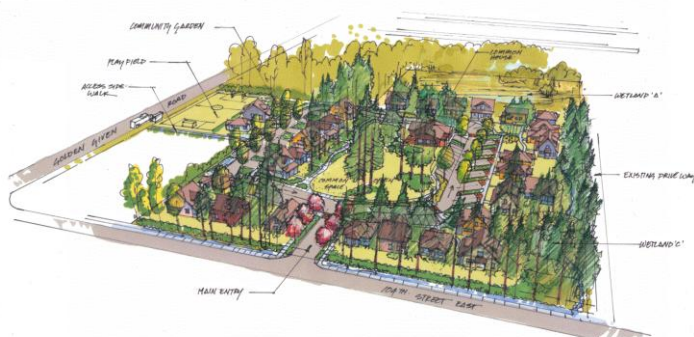
4 The Woods at Golden Given perspective--Tacoma Habitat

house price exceeds your price goal, and should include a review of all agreed upon specifications and building processes to ensure that your affiliate is capable of building to the plan.