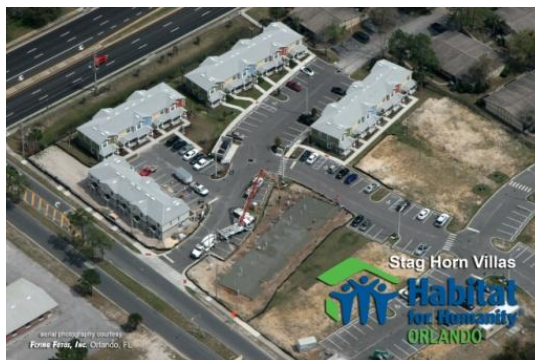
5 Stag Horn Villas community—Orlando Habitat

Consider building a Habitat neighborhood in order to facilitate community building and neighborhood safety. Begin by acquiring a large parcel of land to create a Habitat development. Instead of building all the houses at once, build over several years and seek to build a Habitat