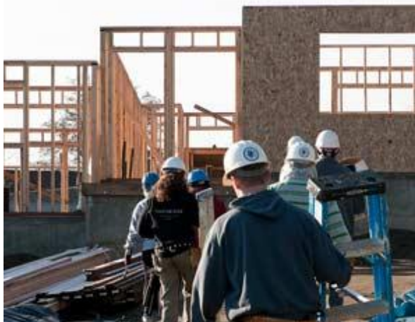
11 The Rainier Vista phase 1 project features retrofit of existing rental housing into a mixed-income community of rental units, condos, and houses—Seattle Habitat

Retrofit of existing houses and unused or underutilized buildings lowers the environmental footprint of your project and can save you money. Consider retrofitting commercial buildings for multifamily apartments or townhouses, or retrofitting existing single family houses that have been foreclosed on or abandoned; these can often be obtained at a reasonable price. Note that retrofit construction requires a different set of materials, labor skills, and plans than new construction and that retrofit projects may not be appropriate for your affiliate.