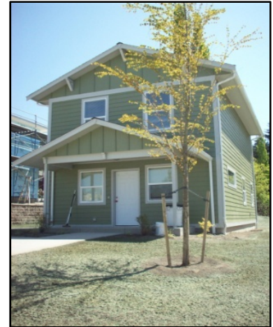
2. PIERCE COUNTY HABITAT HOME

The affiliate's selection committee accepts applications from families with substandard living conditions – barely insulated homes, children of different genders crowded into sleeping quarters with a parent, severe mold issues, and severe safety hazards. However, Habitat is not a handout, but a hand up. In addition to making a 0.5% down payment and 0% interest mortgage payments, homeowner families are required to commit 500 hours of 'sweat equity' building their own home and the homes of other Habitat families. For more information about the affiliate and its projects, please visit TPCHFH's website at: http://www.tpc-habitat.org/index.html .