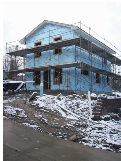
23 Larabee Terrace Project