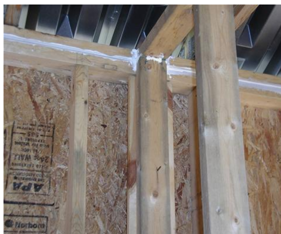
6 24" on center framing and sealed penetrations--TriState

Your primary indoor air quality goal should be to create a continuous air barrier in the building envelope through the use of products such as housewrap, tape, caulk, foam, weather stripping, gaskets, and sealant, and through the proper installation of vents, doors, and fenestration products. All seams, holes, and other breaks in the barrier should be sealed or filled—send a team of volunteers around before installing insulation, before hanging drywall, and after hanging drywall to ensure that every hole in the envelope is filled. Fill any wide cracks or gaps with foam board or another insulating material. To make sure the air sealing is done correctly, have a staff member perform caulking and sealing demonstrations and keep diagrams and checklists on the job site that list and then visually show what must be caulked, sealed, and filled with foam or foam board. Note that air sealing is the easiest and most cost effective manner of reducing household energy use. Unless you construct a tight building envelope, your blower door test will not meet the tightness goals set out in Section 16 “Verification” of <0.35 air changes per hour (ACH) or a leakage ratio of <1.25\text{in}^2/100\text{ft}^2 or 2.4\text{in}^2/100\text{ft}^2 of surface area. Air sealing measures have the added benefit of keeping out bugs and rodents.