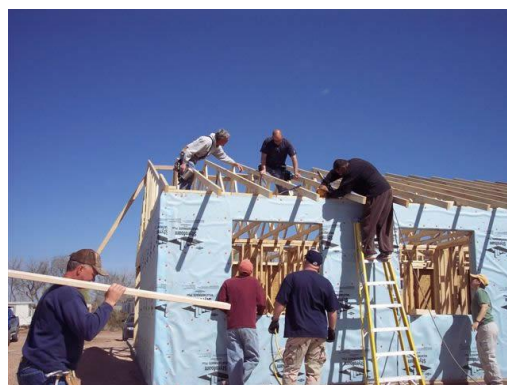
21 Otero County project

Otero County Habitat in Alamogordo, New Mexico builds about four houses per year in the Alamogordo and Tula Rosa area. All houses in 2009 are Five Star ENERGY STAR certified and Otero Habitat's lowest HERS score to date is a 47. In addition to being an ENERGY STAR partner, Otero Habitat is has reached "Silver" level in the Build Green New Mexico program and recently began working to develop a near-zero energy project with the help of energy efficiency consultants at ConSol a member of the Building America BIRA team. Located in a desert environment, Otero Habitat focuses on the solar orientation of their houses on the lots and passive solar heating through window placement and thermal mass.