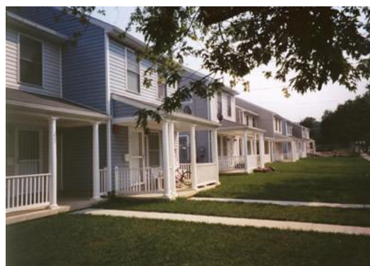
19 Deanwood housing development

Habitat for Humanity of Washington DC builds approximately 10 houses per year on their 53-lot development in the Deanwood neighborhood of Northeast Washington, DC. Over the past year their houses have been achieving a HERS score of 74-75 and have been ENERGY STAR certified. The houses are located in close proximity to public transportation (both a metro station and bus lines) and feature numerous recycled and high performing materials, including recycled gravel and rain gardens with recycled concrete pavers, permeable pavers on the driveways, ICFs in the basement, and Hardiplank siding.