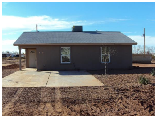
14 Otero County Habitat hot-dry landscaping

The vegetation you plant must not need additional watering after the first year, must not need extensive pruning or maintenance, and should consist of indigenous plants wherever possible. Some families may express interest in planting and maintaining a garden. If you have the resources to clear and prepare a garden area, you are encouraged to do so. You may be able to recruit local nurseries to teach the family how to care for a garden and/or to donate healthy vegetable seeds or plants for the garden. Ultimately, the affiliate involvement should be limited to garden preparation and families rather than the affiliate being responsible for planting and maintaining the garden.