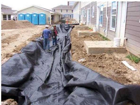
12 Water runoff drains at Bails Townhome Community— Metro Denver Habitat